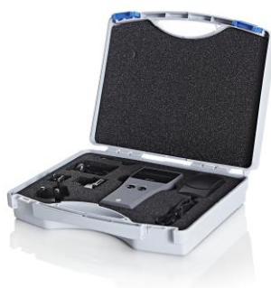
Protective Carry case