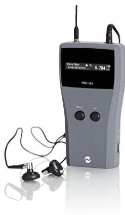
PRO-SL8 with earphones